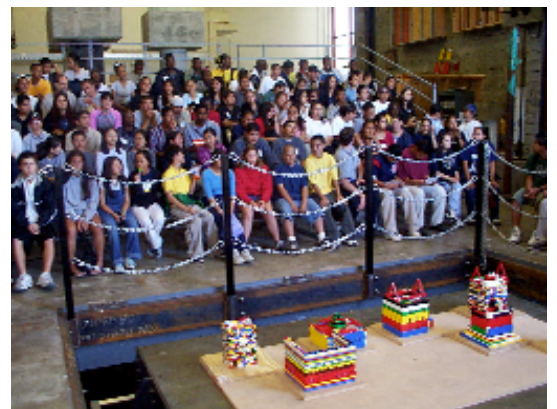
Figure 3.3 – K-12 students await the Lego-quake

An example of PEER's outreach activities is a Learning with LEGO Program inspired by a campus initiative at UC Irvine that brought over 800 K-12 students from socio-economically disadvantaged areas to the campus for an open house and shake-table demonstration in Spring 2000. One might think that seismic simulation is a topic only for advanced graduate students, but it has caught the attention of these younger students as well. The event was a competition among local elementary, middle, and high schools for the honor of having the best seismic designs. The LEGO structures were tested on one of PEER's major earthquake simulators housed in the UCI Structural Engineering Test Hall. The event has been repeated in 2001 and 2002, currently under the leadership of Tara Hutchinson, PEER Education Committee member from UC Irvine. The Education Committee is considering expanding this effort to other PEER campuses next year.