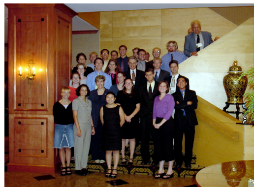
Figure 3.2 – REU students at tri-center meeting

Other examples of the team-based research/educational culture include the Research Experience for Undergraduates Summer Internship Program (REU), which has sponsored PEER students working at an institution other than their home campus, or students from campuses outside the PEER consortium for the past three summers. Students work as interns on a PEER-funded research project mentored by a PEER faculty member. The REU Program offers a Communications Workshop for the interns to assist them with the oral and written report requirements of the project. PEER and SCEC have teamed up over the past two summers to sponsor this activity jointly. Interns from both centers attend a one-day workshop at USC. They are provided with the basics of thoughtful and successful oral and written communication skills. The meeting affords them the opportunity to