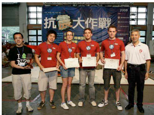
Fig. 1 IDEERS testing in 2008

Based on the professional structural analysis PISA3D developed by NCREE, a simple graphical user interface was developed for high school students to design their building models for the IDEERS competition in 2007. This year the software was enhanced to improve the efficiency and functionality. The software allowed the students to design their model, check the dynamic analysis results, compare and learn the effectiveness of different types of components and structural systems for seismic resistance. Rules in IDEERS 2008 were slightly modified from those in 2007. Each high school team constructed a model, mainly made of timbers, to resist strong ground motions up to 800 cm/sec 2 while carrying up to 18 kg of loads. Each undergraduate team was requested to build an L-shape building that could resist the torsion vibration mode. Each post-graduate team was requested to build a model using the concepts of energy dissipation and/or seismic isolation. Participating students brought their creativity into full play, and presented diverse types of structural designs. More information and award winner lists of this event are available at http://w3.ncree.org.tw/ideers/2008 . (Yuan-Sen Yang, ysyang@ncree.org.tw )