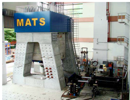
Fig. 2 Overview of the MATS