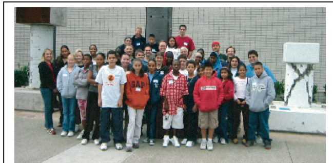
Figure 3.2 - Middle school students and teachers gain experiences in science and earthquake engineering through PEER's Research Experience for Teachers program

The PEER Summer Internship Program is intended to interest, attract, train and retain