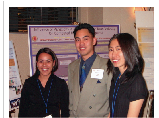
Figure 3.3 - PEER Summer Interns at the EERI 2003 Annual Meeting in Portland

promising undergraduates who have expressed an interest in earthquake engineering research. Students work, over a period of ten weeks, under the direction of a PEER faculty mentor on a PEER-funded research project during the summer months and submit a report detailing their research experience during the fall term. We endeavor to restrict interns to working on projects that are current or recent-past PEER projects, although in exceptional cases we will accept students to work on PEER-related projects. During the past six years, PEER sponsored participating students to attend the EERI Annual Meetings in St. Louis, Monterey, Long Beach, Portland, and Los Angeles.