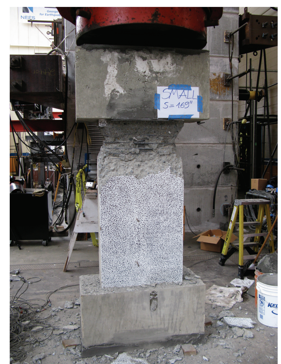
Specimen 2; Spacing: 1.69" After testing