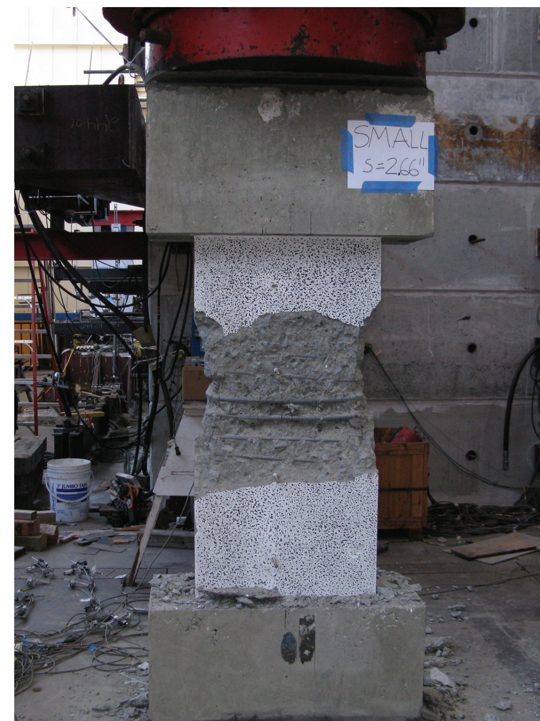
Specimen 1; Spacing: 2.66" After testing