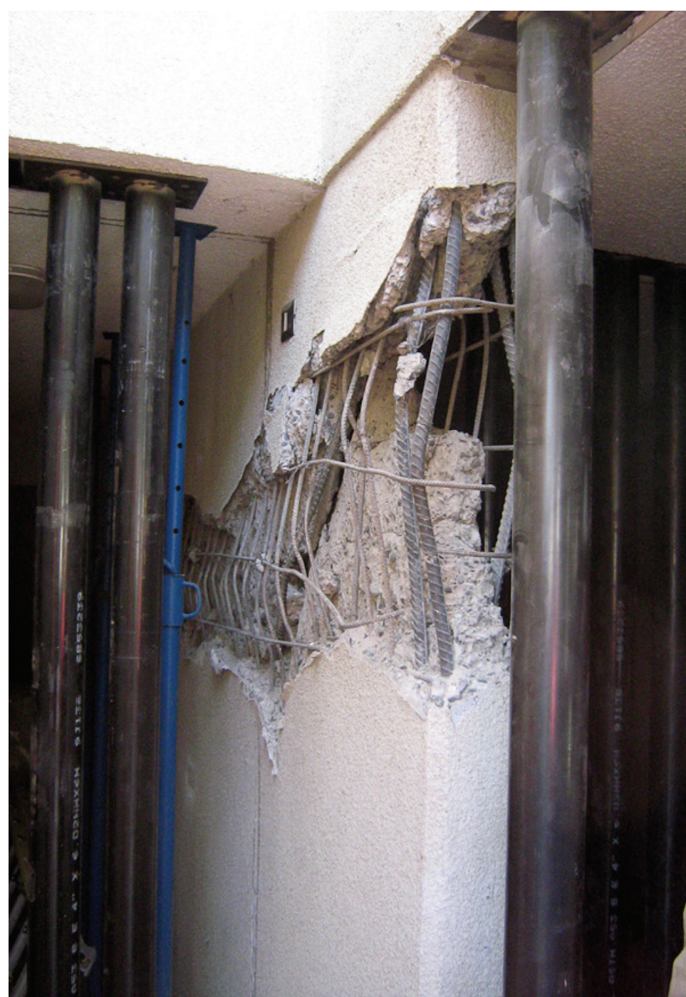
Boundary Element Crushing Failure observed in Chile 2010 Earthquake